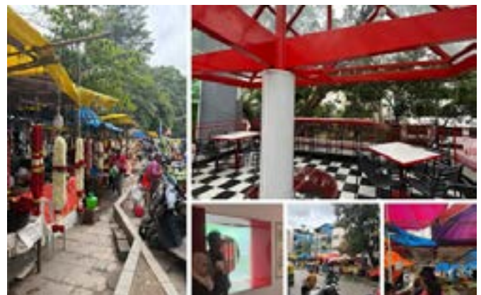
Hospitality & Informal Market Site visit done by V Semester students

BMSCA D&P students bridged theory and practice through immersive site visits. Highlights included exploring modular systems at Homelane, various sites under construction phase, heritage adaptive reuse buildings, public buildings, informal markets, hospitality buildings and various other typologies. These sessions provided critical insights into sustainability, materiality, and urban context.