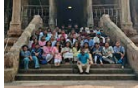
Brihadheeswara Temple visit in Thanjavur, Tamil Nadu