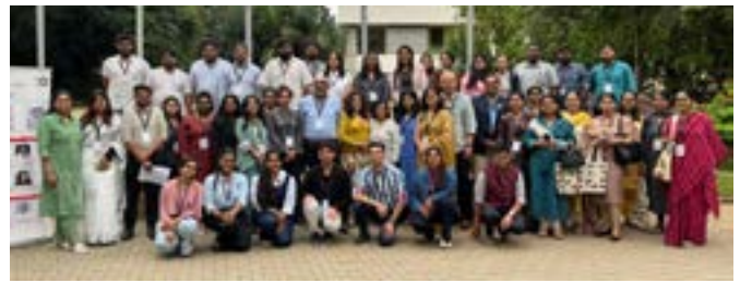
Group Photo at the end of FDP organised in collaboration with IIID.