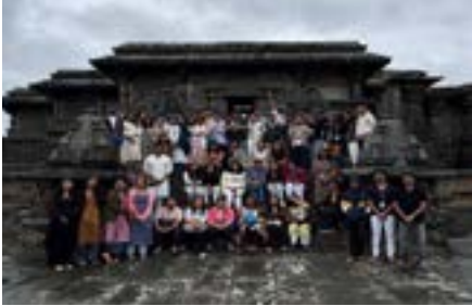
Students observing the materiality and detailing of the Hoysaleswara Temple, Halebidu

BMSCAD&P organised National Study Tours for UG students across three enriching routes, each designed to deepen architectural understanding through direct observation. One group explored the temple towns of Tamil Nadu Thanjavur, Chettinad, Karaikudi, Madurai, and Rameshwaram over 7 days, studying spatial organization, living heritage, and cultural identity. A second group spent 3 days visiting Karnataka's heritage sites including Halebeedu, Belur, and Shravanabelagola, engaging with Hoysala and Dravidian architecture, traditional craftsmanship, and sustainable design. A third group travelled over 7 days to Pune and Aurangabad, experiencing architectural diversity from historic Wada houses to contemporary sustainable campuses. All three tours were guided by dedicated faculty, bringing classroom learning vividly to life.