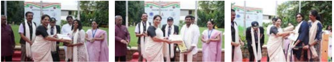
Students of BMSCA D&P received Student Recognition Awards During Independence Day Event.