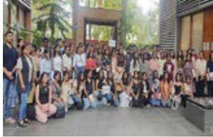
Students at India House, CCBA Designs, Pune, Maharashtra.