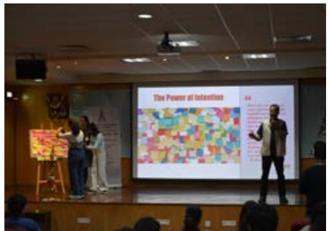
Invited expert engaging with the students