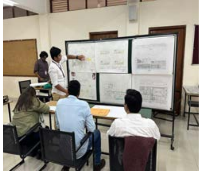
Student describing his pre-design studies for a placemaking project enhancing the precincts of Karanji Anjaneyaswami temple, Bengaluru

From July to December 2025, BMSCA D&P studios explored sensorial and responsive architecture. First-semester students mastered design fundamentals through functional cafes, clinics, and themed kiosks. Third-semester work focused on placemaking for cultural heritage sites, designing community-oriented libraries. Fifth-semester studios integrated AI and robotics into museum designs, examining the human-machine-environment dialogue. Seventh-semester students developed adaptive sports arenas utilizing performative skins and modular systems. Simultaneously, B.Des students investigated human-object interactions and universal design, emphasizing user-centered empathy within the design ecosystem.