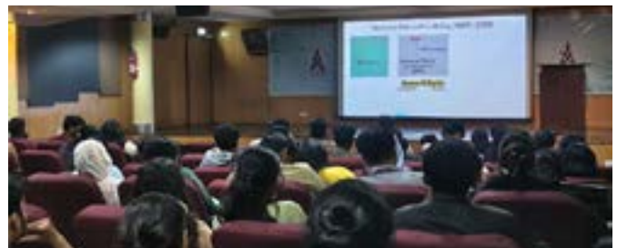
Awareness event celebrating 5th Anniversary of NEP 2020 at BMSCA D&P to highlight the importance of National Education Policy 2020.